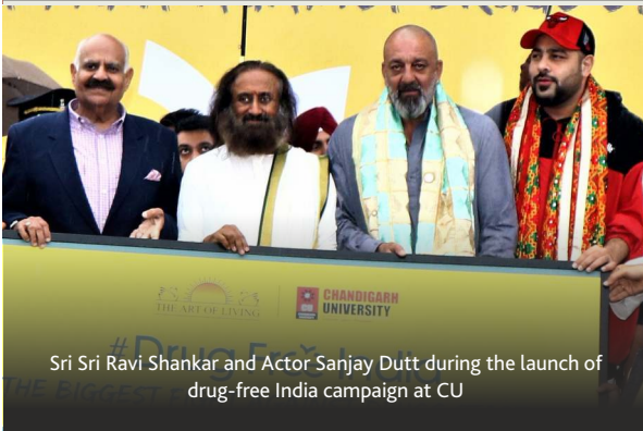
Sri Sri Ravi Shankar and Actor Sanjay Dutt during the launch of drug-free India campaign at CU