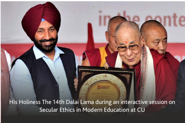
His Holiness The 14th Dalai Lama during an interactive session on Secular Ethics in Modern Education at CU