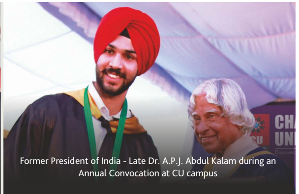
Former President of India - Late Dr. A.P.J. Abdul Kalam during an Annual Convocation at CU campus