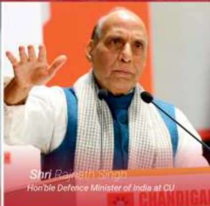
Shri Rajnath Singh Hon'ble Defence Minister of India at CU