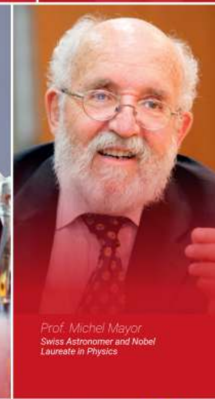
Prof. Michel Mayor Swiss Astronomer and Nobel Laureate in Physics