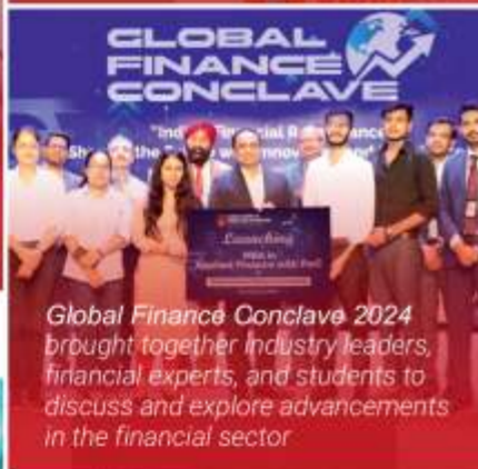
Global Finance Conclave 2024 brought together industry leaders, financial experts, and students to discuss and explore advancements in the financial sector