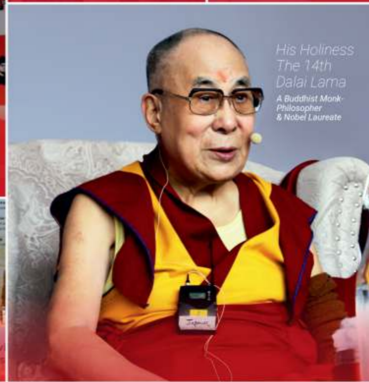
His Holiness The 14th Dalai Lama A Buddhist Monk- Philosopher & Nobel Laureate