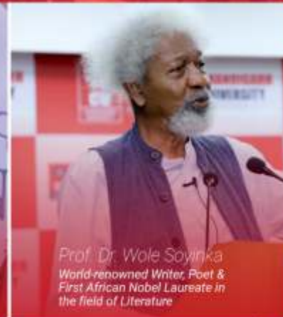
Prof. Dr. Wole Soyinka World-renowned Writer, Poet & First African Nobel Laureate in the field of Literature