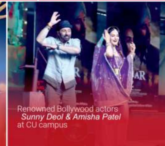
Renowned Bollywood actors Sunny Deol & Amisha Patel at CU campus