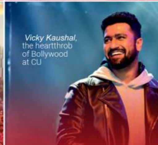
Vicky Kaushal , the heartthrob of Bollywood at CU