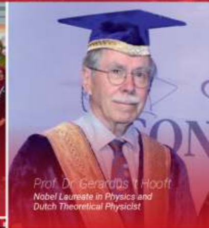
Prof. Dr. Gerardus 't Hooft Nobel Laureate in Physics and Dutch Theoretical Physicist