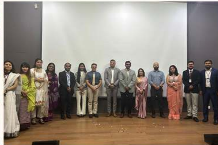
World Sight Day 2024