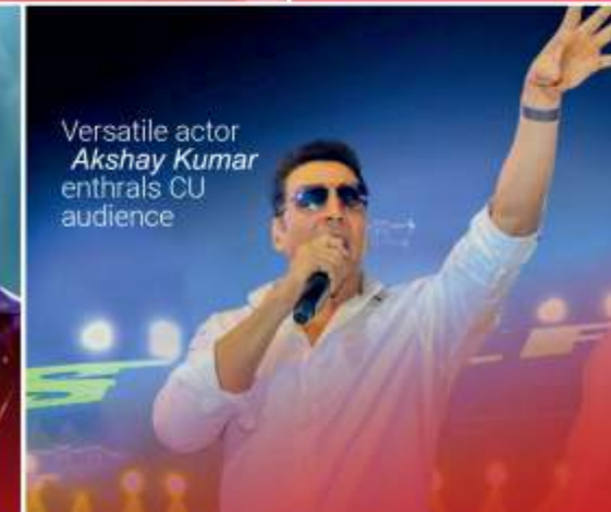
Versatile actor Akshay Kumar enthralled CU audience