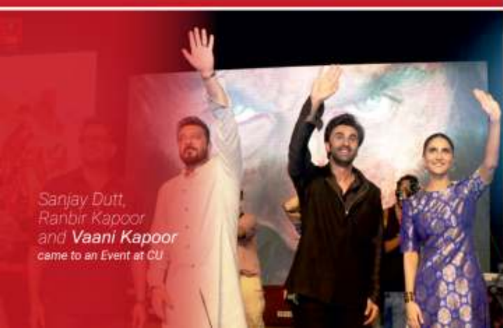
Sanjay Dutt , Ranbir Kapoor and Vaani Kapoor came to an Event at CU