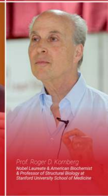
Prof. Roger D. Kornberg Nobel Laureate & American Biochemist & Professor of Structural Biology at Stanford University School of Medicine