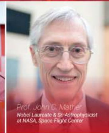
Prof. John C. Mather Nobel Laureate & Sr. Astrophysicist at NASA, Space Flight Center