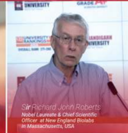
Sir Richard John Roberts Nobel Laureate & Chief Scientific Officer at New England Biolabs in Massachusetts, USA