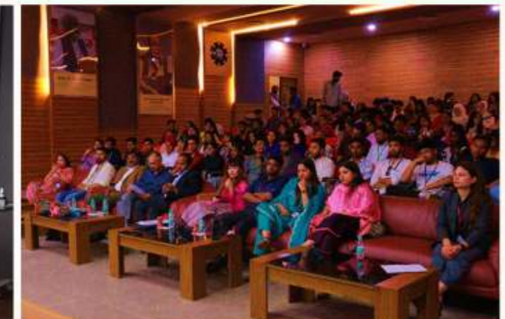
World Optometry Day 2024- Expert talk session