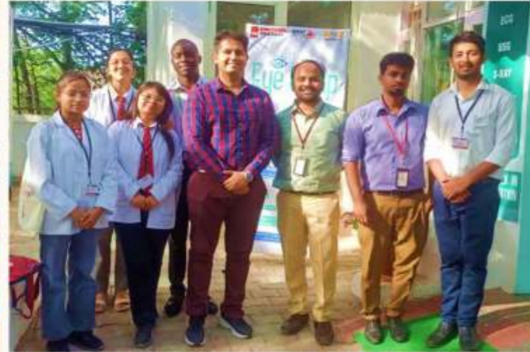
Free Eye Screening at Tatvika Digital Health-Chandigarh University