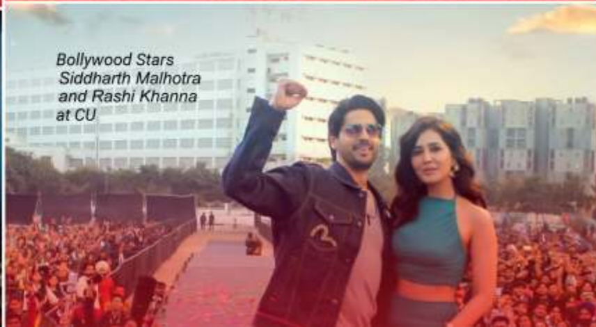
Bollywood Stars Siddharth Malhotra and Rashi Khanna at CU