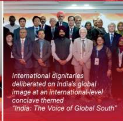
International dignitaries deliberated on India's global image at an international-level conclave themed "India: The Voice of Global South"