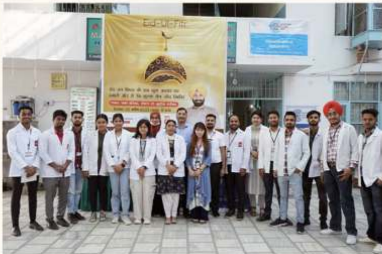
Free Eye Checkup Camp On The Occasion Of Eid - At Jama Masjid Burali, Sector 45, Chandigarh