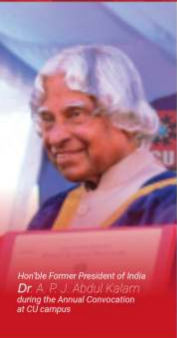
Hon'ble Former President of India Dr. A. P. J. Abdul Kalam during the Annual Convocation at CU campus

Over the years, our vibrant campus has had the privilege of hosting many eminent personalities, each leaving a lasting impact with their wisdom, experiences, and accomplishments. Visits from Nobel Laureates and industry titans have enriched our academic environment and cultivated a dynamic, well-rounded university experience for the students.