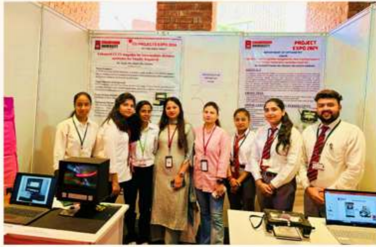
CU Project Expo 2024