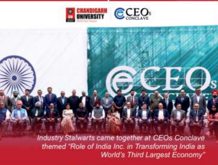
Industry Stalwarts came together at CEOs Conclave themed "Role of India Inc. in Transforming India as World's Third Largest Economy"