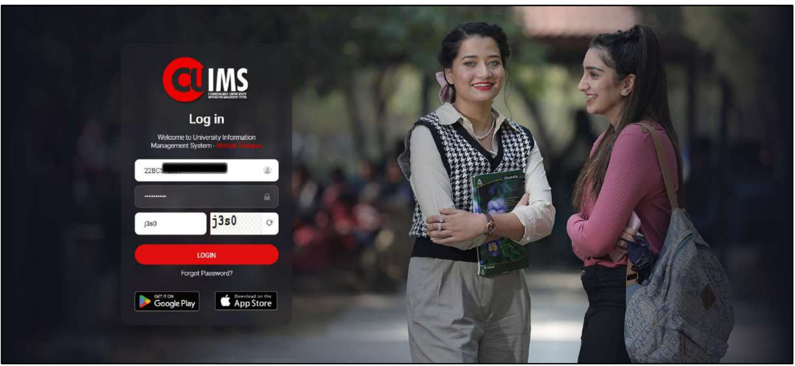
Log in to your CUIMS Portal