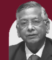
Hon'ble Mr. R. Venkataramani Attorney General for India