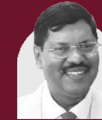
Hon'ble Justice Mr. B.R. Gavai Chief Justice of India