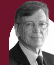
Hon'ble Justice Mr. Lord Carnwath Former Judge, Supreme Court of UK